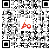
LimX Oli Specifications